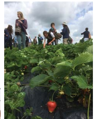
Scrumping in the strawberries