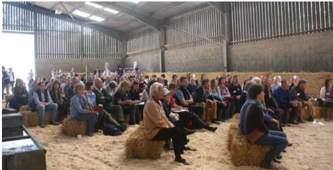
Welcomes and introductions in the Dairy Barn